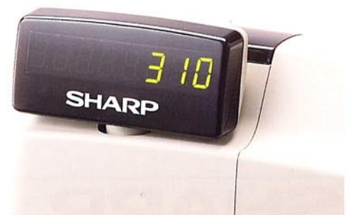
Bold Customer Display